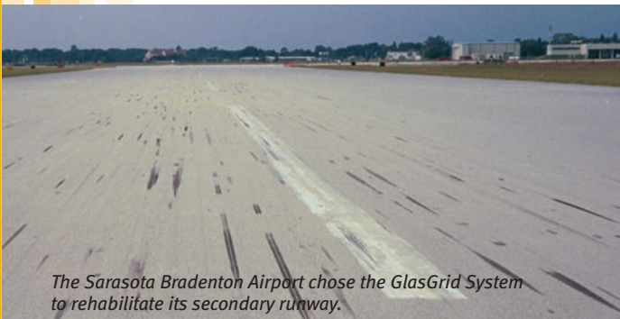
The Sarasota Bradenton Airport chose the GlasGrid System to rehabilitate its secondary runway.

Application: The Sarasota Manatee Airport Authority operates Sarasota Bradenton International Airport to serve commercial and general aviation aircraft flying into south Florida. In 1995, the Airport Authority investigated options for rehabilitating the facility's secondary runway.